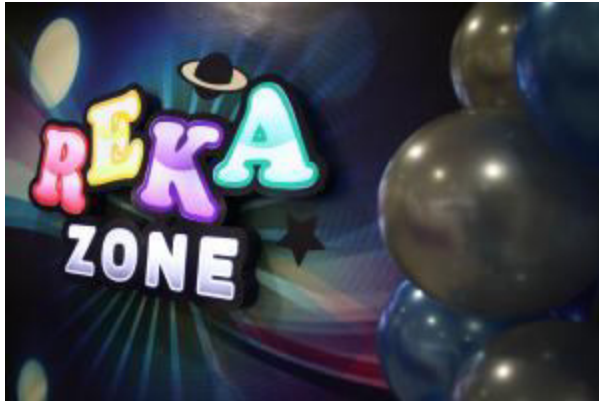
REKA ZONE Indoor Playland, IOI Mall, Puchong

In conjunction with the launch of REKA ZONE Indoor Playland, children from Rumah Kanak-Kanak Tengku Budriah (Cheras) were given a special treat at the playland for a day of fun. Moreover, the fun did not just end here. REKA is donating to the home one specially designed playground equipment – the REKA RS 9000 – worth RM17,500. Rumah Kanak-Kanak Tengku Budriah is one of the eleven children’s homes under the supervision of the Department of Social Welfare (JKM). The home is currently caring for 203 children from one month to 17 years old.